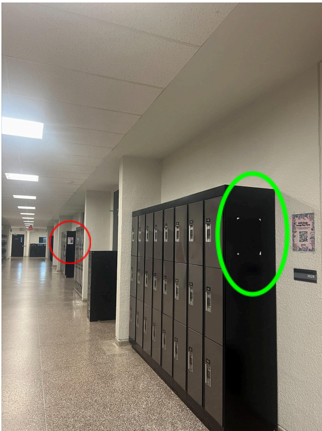
Samantha's poster is on the back row of lockers, circled in red.