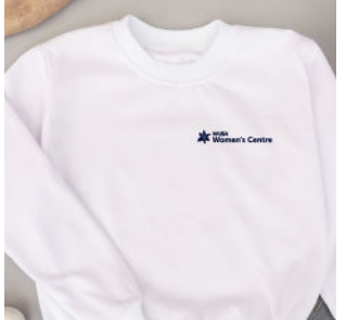
For merchandise use monochromatic logo.

Heavy use of photos with people, and colour overlay.